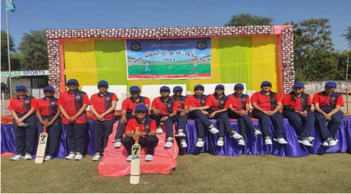
Gujarat Government has organised 1st DGP Cricket Cup-2023 for female prisons officials at Karai, Gandhinagar,