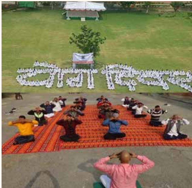
Yoga Day at Model Jail, Chandigarh