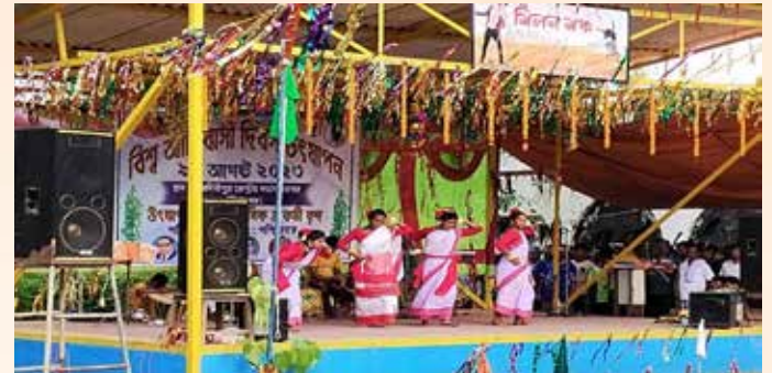
Celebration of International Day of the World's Indigenous Peoples/World Tribal Day on August 9, 2023 at Alipore Jail Complex, West Bengal.