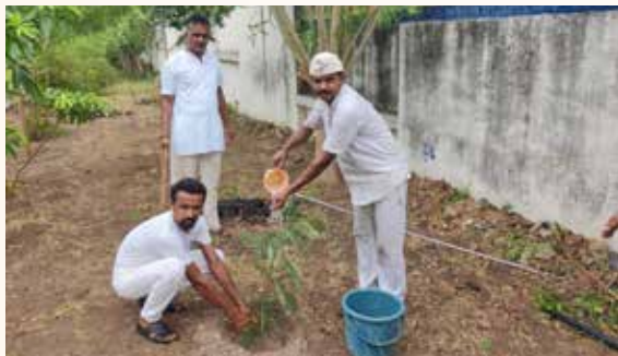
Glimpse of World Environment Day on 05 June 2023 at Gujarat Prisons