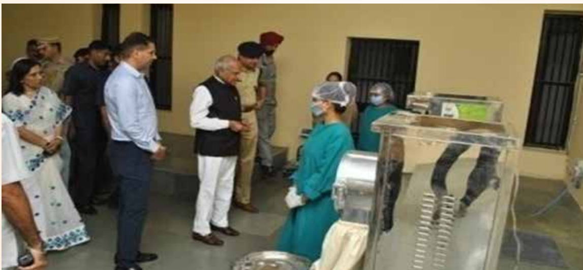
पंजाब के माननीय राज्यपाल श्री बनवारीलाल पुरोहित का मॉडल जेल, चंडीगढ़ 13.05.2023 में दौरा