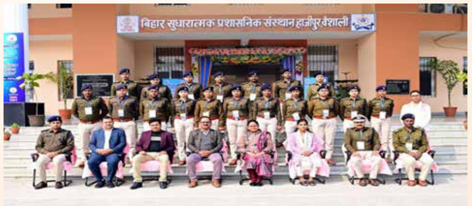
Bihar Institute of Correctional Administration द्वारा 'Incident Response System: Challenges and Solutions in Prison Administration' विषय पर दिनांक 19 से 21 जनवरी, 2023 तक जेल प्रशिक्षण कार्यक्रम, हाजीपुर, BICA में आयोजित किया गया।