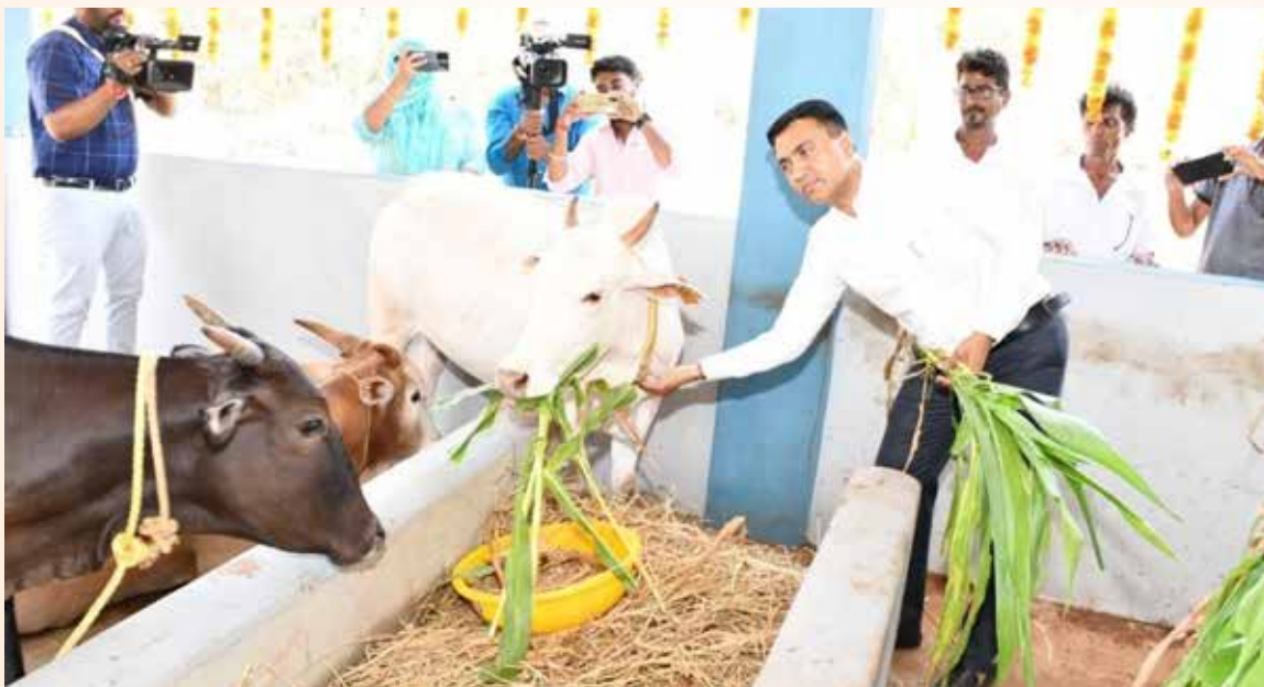
Goa Prison Department constructed cow shed within prison premises for dairy farming project.