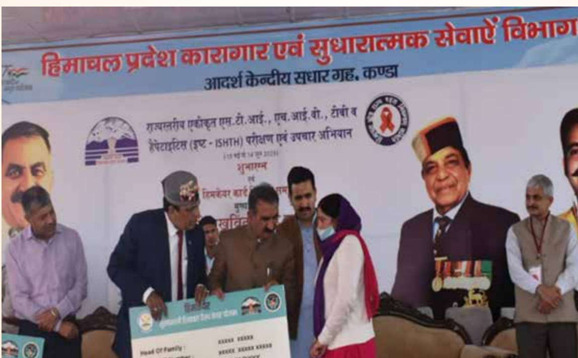
Shri Sukhvinder Singh Sukhu, Chief Minister of Himachal Pradesh launched the 'Himcare Scheme' on 15.05.2023 for jail inmates, by proiding Himcar cards to the prisoners at Model Central Jail, Kanda in Shimla