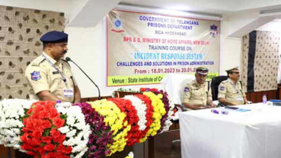
तेलंगाना जेल विभाग द्वारा 'Incident Response System – Challenges and Solutions In Prison Administration' विषय पर दिनांक 18 से 20 जनवरी, 2023 तक जेल प्रशिक्षण कार्यक्रम State Institute of Correctional Administration, हैदराबाद में आयोजित किया गया।