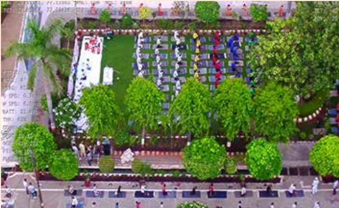
Yoga for the prisoners of District Jail Ghaziabad for their mental and physical health.