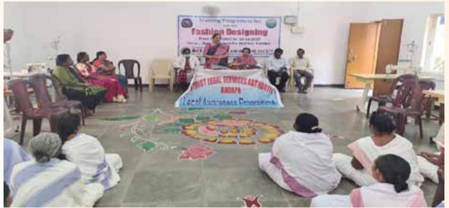
Training Programme for prisoners on jute making and fashion designing from 01-04-2023 to 30-04-2023 at Andhra Pradesh Prisons.