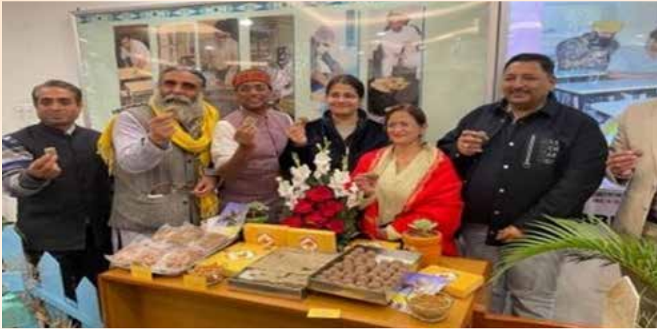
Millets Mithai Counter at the Navsrijan, The Shop run by the Jail Administration of Model Jail, Chandigarh on the Occasion Of International Year Of Millets 2023 On 01.01.2023 at Model Jail, Chandigarh