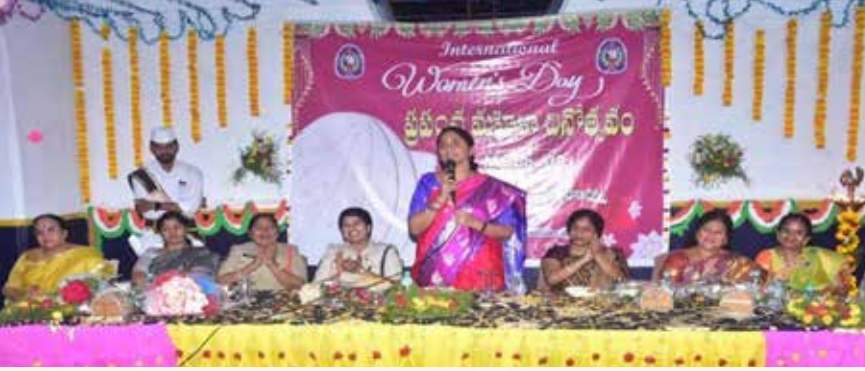
WOMEN'S DAY CELEBRATIONS ON 08.03.2023 IN SPECIAL PRISON FOR WOMEN; RAJAMAHENDRAVARAM, ANHRA PRADESH