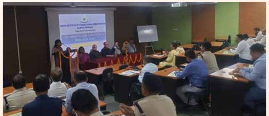
जेल प्रशिक्षण कार्यक्रम विषय 'महिला सुरक्षा' पर हाजीपुर, BICA मे 17-06-2023 से 23-06-2023 तक आयोजित किया गया ।