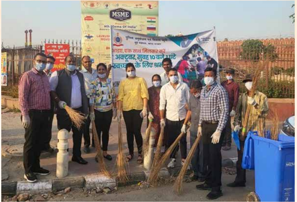
BPR&D अधिकारियों एवं कर्मचारियों द्वारा लाल किला, नई दिल्ली में स्वच्छता अभियान।