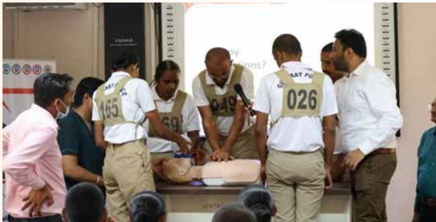
CPR AWARENESS PROGRAMME WAS CONDUCTED BY INDIAN RED CROSS SOCIETY, AT GUNTUR JAIL TO THE OFFICERS AND STAFF MEMBERS.